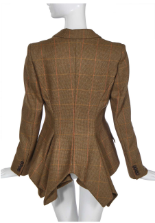
An Alexander McQueen tweed hacking jacket, pre-collection, Autumn-Winter 2009-10 labelled , size 42, the green/brown ground woven with orange and beige windowpane checks, with woven leather buttons, swallowtails to rear, bust 90cm, 36in Provenance: The Trino Verkade Collection £400-600