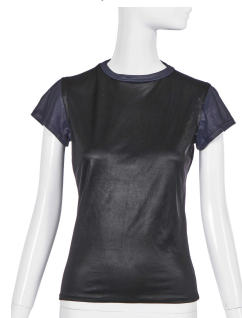
A Westwood/McLaren SEX Original black stretch nylon T-shirt, circa 1975 labelled , with grey sleeves and neck, bust 86-102cm 34-40in £500-900

Note that charges apply, see website for details