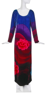
A Hanae Mori printed velvet dress, 1970s labelled, size 10 , printed with waves and peonies in pink and blue tones, the fabric gathered at elasticated neckline, bust 86cm 34in £300-500