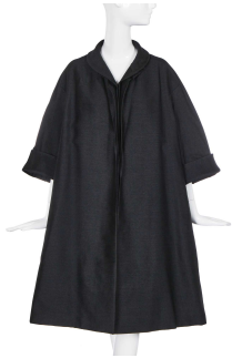
A Christian Dior black challis coat, circa 1955 black label , with elbow-length sleeves and a turned-over collar, lapels with unusual buttonholes on both sides that continue into the front closure return and the rear vent return, bust approx 134cm, 52in £600-800