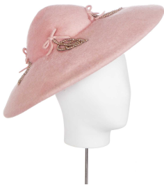
A Christian Dior New York pink felt hat, 1950s labelled , with a wide brim, the brushed felt decorated with four bows and embroidered with pearl bead leaves, diameter 46cm, 18in £200-300