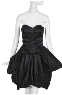
An Alexander McQueen black zibeline mini dress, 'Natural Distinction, Un-Natural Selection', commercial collection, Spring-Summer 2009 labelled , size 42, with an integral bustier and structured skirt, bust 84cm, 36in, waist 72cm, 28in Provenance: The Trino Verkade Collection £400-500