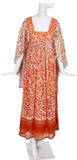
A Catherine Buckley painted lace dress, 1970s labelled , of white lace spray painted with red and orange spots, the fabric gathered at raised empire-line waist, handkerchief sleeves, bust 81cm 32in , together with an original Catherine Buckley hanger (2) £400-600