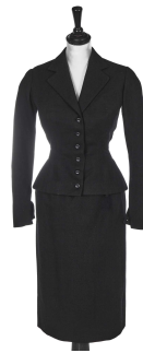
A Christian Dior haute couture black wool day suit, probably Autumn-Winter 1949 labelled and numbered 11497, 11498, inscribed 30278 , the fitted, tailored single-breasted jacket with small concave buttons, nipped waist, curved padded hips, rear martingale belt with small central bow, the cuffs with diagonal fold detail with matching pencil skirt, bust 92cm, 36in, waist 64cm, 25in (2)