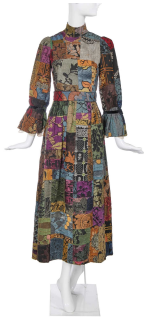
A Catherine Buckley patchwork gown, 1970s labelled , in autumnal shades, with velvet ties to cuffs, stand collar, voluminous sleeves, white lace cuffs, matching belt, bust 81cm, 32in , together with an original Catherine Buckley hanger (3) £1,000-1,500