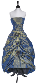
A Carosa Roma shot-silk evening gown, Italian, 1959 labelled , with additional Holt-Renfew label , of blue/green taffeta, the strapless bodice with integral boned corset, full skirt with draped design and asymmetric hem, accented to centre front with three bows and silk roses, trained floating panel from rear waist, bust 82cm, 32in, waist 66cm, 26in £400-600