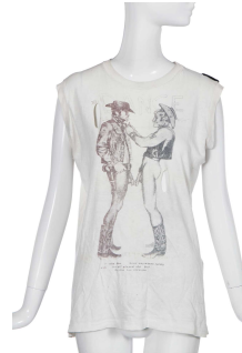
A Westwood/McLaren Seditionaries 'Dancing Cowboys' sleeveless t-shirt, circa 1977 black Seditionaries label to left shoulder , the cream cotton jersey ground printed with two semi-dressed cowboys and 'Dance Saturday Night', with a transcript of their conversation at the base, chest approx 112cm 44in £600-1,000