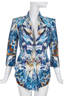
An Alexander McQueen crystal print jacket, 'Natural Distinction, Un-Natural Selection', Spring-Summer 2009 labelled , size 42, with digital diamond facet print, cropped sleeves, asymmetric hem, rhinestone buttons to cuffs and front, bust 88cm, 34in Provenance: The Trino Verkade Collection £450-600