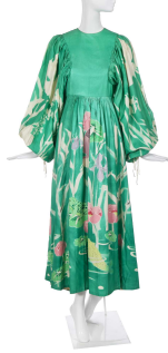
A Catherine Buckley printed silk 'pond' dress 1970s labelled , the ribbed ivory silk ground printed with depictions of pond life, with voluminous sleeves, self-ties to cuffs, bust approx 81cm 32in, waist 71cm 28in ; together with an original Catherine Buckley hanger (2) £400-600