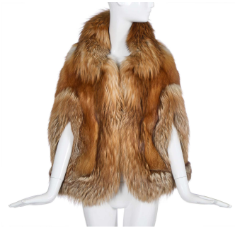
An Alexander McQueen red fox fur cape, pre-collection, Autumn-Winter 2009-10 labelled , with collar and ivory silk lining Provenance: The Trino Verkade Collection £400-600