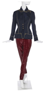
An Alexander McQueen navy wool jacket, 'The Girl Who Lived in the Tree' commercial collection, Autumn-Winter 2008-09 labelled , size 42, military-inspired with gold piping and buttons, bust 88cm, 35in , together with a pair of burgundy sequined leggings with satin waistband, Autumn-Winter 2008 pre-collection, waist 80cm, 32in (2) Provenance: The Trino Verkade Collection £400-600